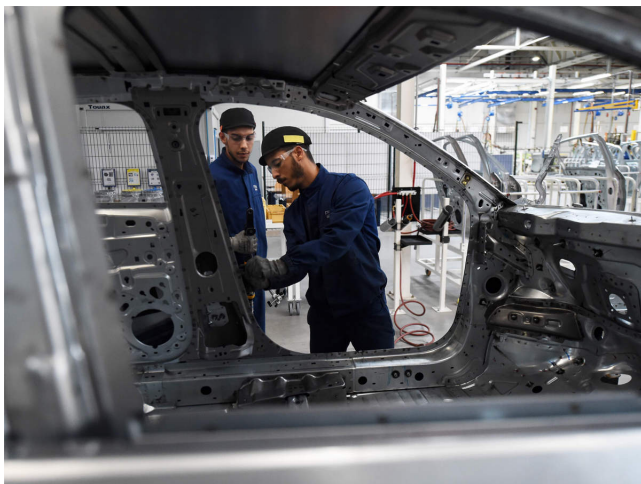
The Indian auto component industry contributes 2.3 percent to the country's GDP and employs about five million people.